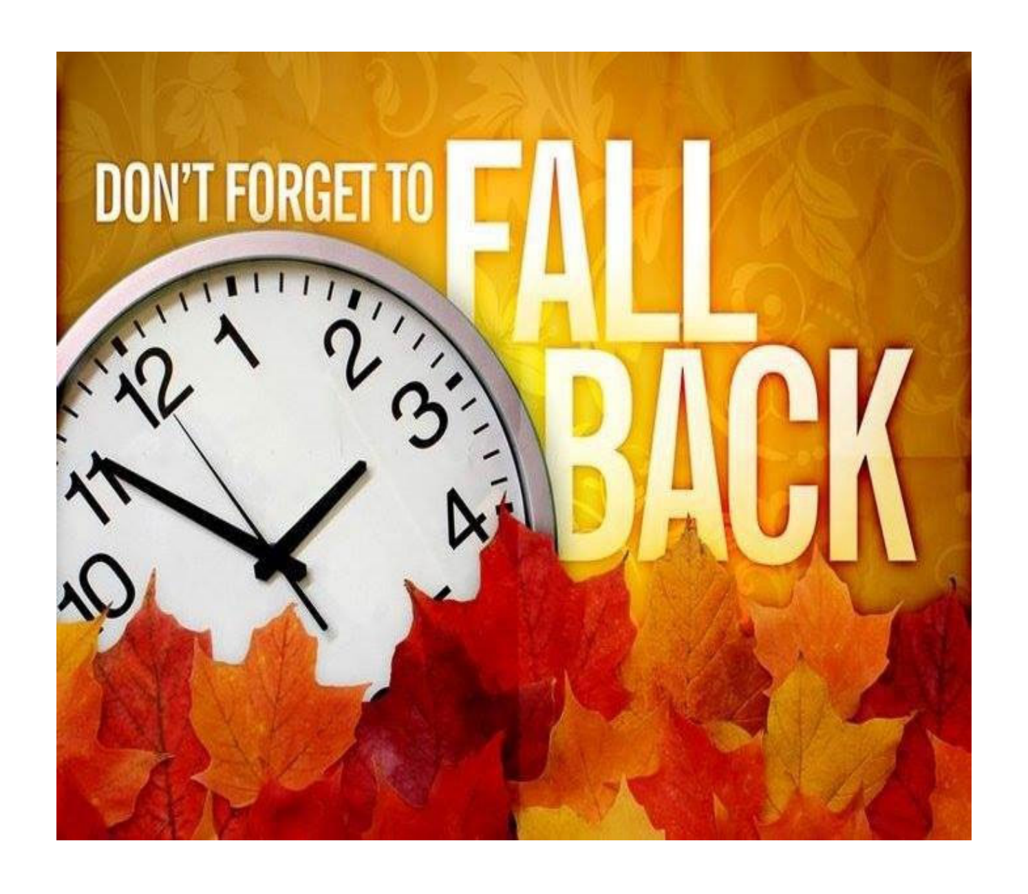
Time Changes November 5, 2023 Set your clocks back 1 hour before going to bed on Saturday night.